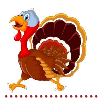
First News November

First Evangelical Lutheran Church, Mifflinburg, PA